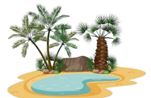
( oasis – forest )