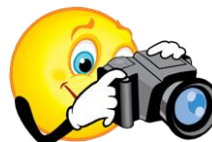
( record – photograph )