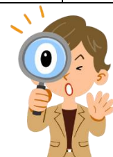
( discover – bargain )