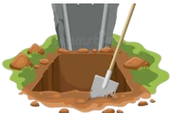
(tombs – plants)