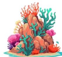
( wildlife – coral reef )