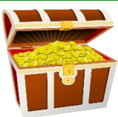
(tombs – treasure)