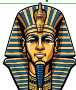
( pharaoh – king )