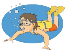
( explore – dive )