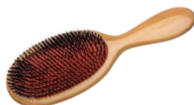
( toothbrush - hairbrush )