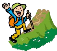
( hike – visit )