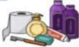
(surface - toiletries )