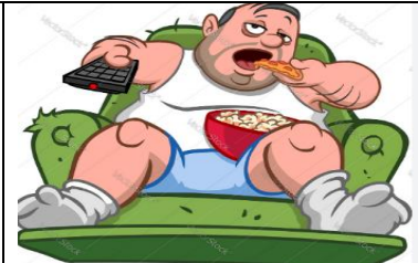
quiz show couch potato