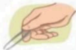
(trekking - tweezers )