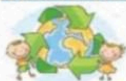
conservation - ranger)