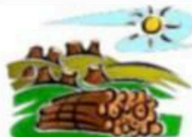
(cozy - deforestation )