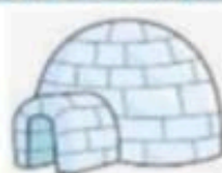
( igloo - cottage)