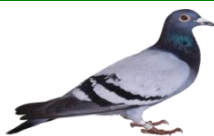
( pigeon - parrot )