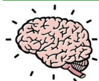
( colon - brain )