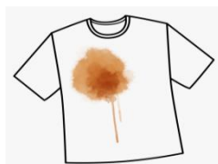
( soap - laundry stain )