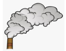
( smoke - fire )