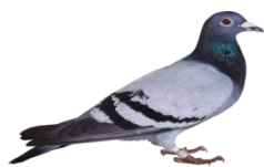
( pigeon - parrot )