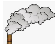
( smoke - fire )