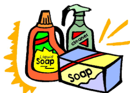
( pet food - detergent)