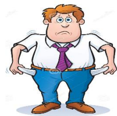
( broke - wealthy)