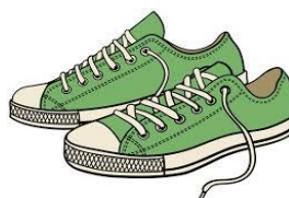
(sneakers - high heels)