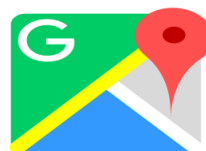
( drop rain - Google map )