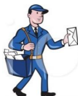
( engineer - mailman )