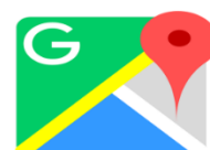
( drop rain - Google map )