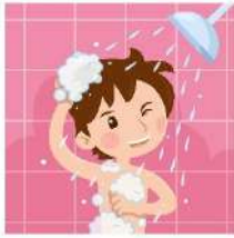
take a shower

karate – wake up – take a shower – work out – brush your teeth