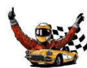
Car race driver